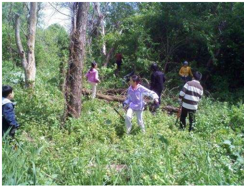
Students restoring near stream at Hidden Lake Forest Preserve.

After registering please contact the Community Liaison (on back) in your area to verify the date, meeting location and supply details.